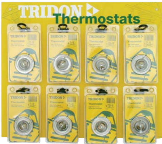
Contents Part No. TTM13